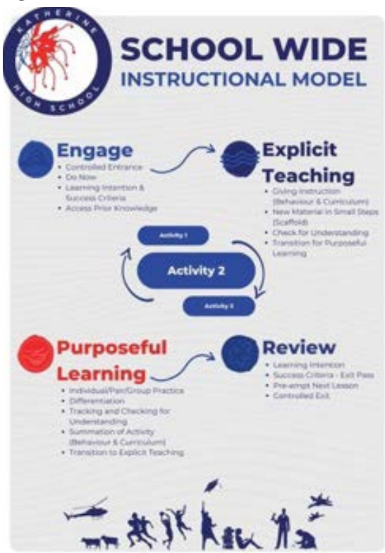
Figure 5: School wide instructional model

Developed by Katherine High School, School Wide Instructional Model, Katherine High School Induction Manual, 2022. Unpublished.