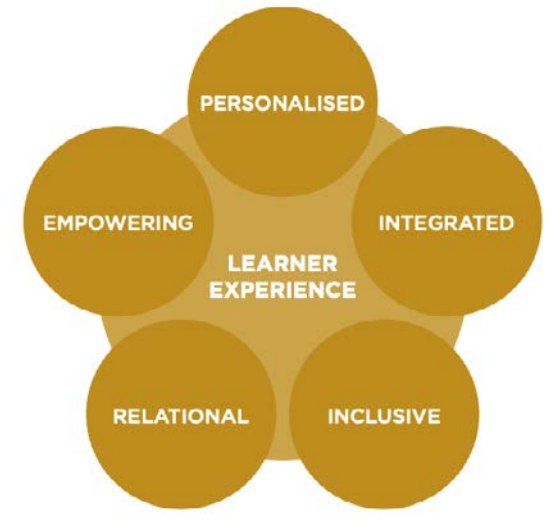
Figure 6: Learner Experience