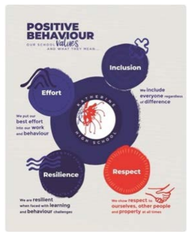
Figure 7: Katherine High's School Positive Behaviour and Values Model

Developed by Katherine High School, Positive Behaviour Values and Expectations, KHS Positive Culture Policy, 2022. Unpublished.