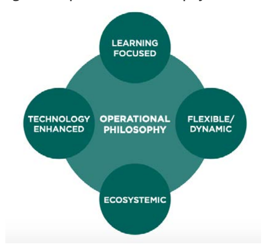
Figure 4: Operational Philosophy